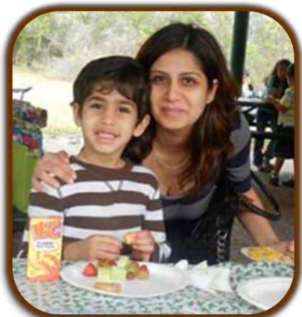
Dev with Mom

The culmination of March led the class on a field trip to Sundew Gardens where the children were able to see firsthand how planting on a farm is done. The children were able to plant their own seeds and pick their own carrots which they washed and ate. We also enjoyed a nice pizza picnic and sack race at the end of which the children were able to pick a prize out of a treasure box.